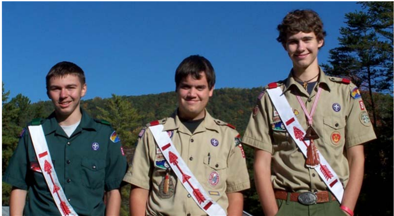
TUTELO LODGE OFFICERS FOR 2009